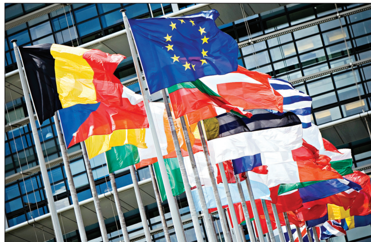
The manifesto for MEPs has been launched ahead of May's European elections

The document asks politicians to commit to support Israel by opposing boycotts, raising concerns about Iran and encourage trade with the EU. They are also asked to defend shechita , brit milah and "an individual's right to wear religious symbols and observe religious festivals and the Jewish Sabbath".