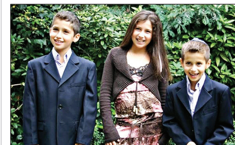
Continued from page 1

Marc said: "The girls had eaten Chinese food every night, but walked past their favourite restaurant to a Kenyan restaurant. Had they gone to their usual place, the attack wouldn't have happened."