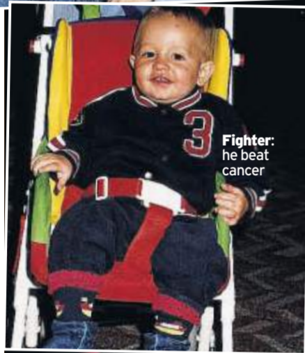
Fighter: he beat cancer