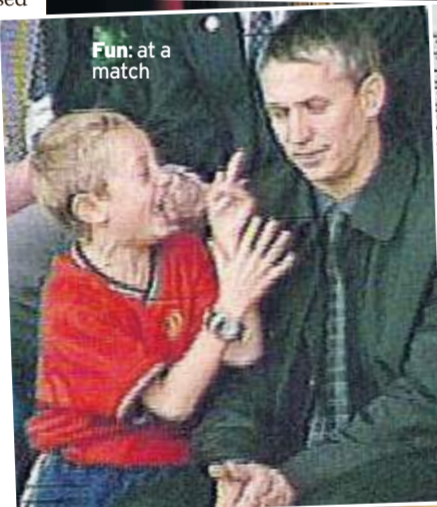
Fun: at a match