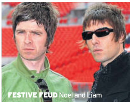
FESTIVE FEUD Noel and Liam