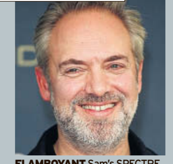
FLAMBOYANT Sam's SPECTRE