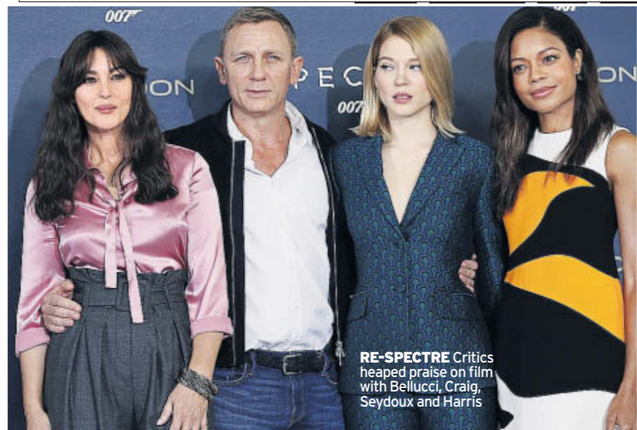
RE-SPECTRE Critics heaped praise on film with Bellucci, Craig, Seydoux and Harris