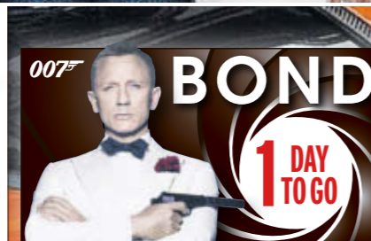
007 BOND 1 DAY TO GO

The star has even been pressured to pile on weight by movie directors who criticised her for being too thin. "I