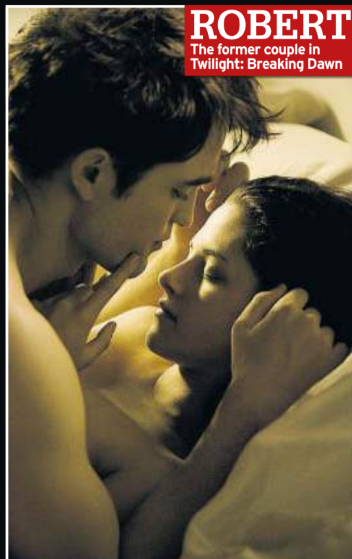
ROBERT The former couple in Twilight: Breaking Dawn

"The neighbours are OK - but friends usually don't come to my house."