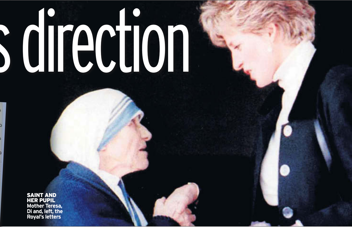
SAINT AND HER PUPIL Mother Teresa, Di and, left, the Royal's letters

"She said she wasn't worthy to even walk in Mother Teresa's footsteps. Diana she could at