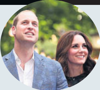
OFFER William and Kate